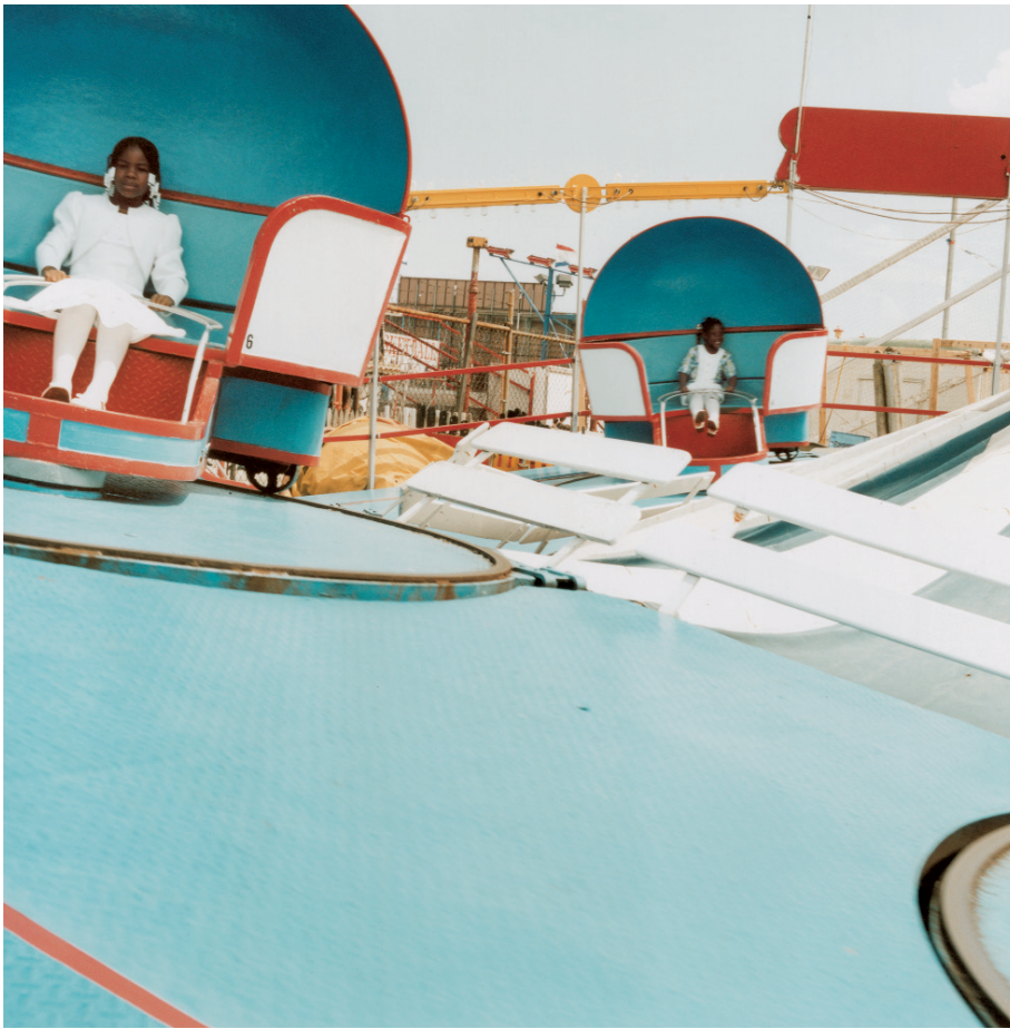
Tilt-a-Whirl , 2000. From Coney Island , by Peter Granser

ture of Coney Island with a foreigner's careful precision and reverence. He doesn't want to get it wrong. And he doesn't. He takes aim but lets his subjects' humanity take over. The resulting images are poignant, sad, comical, nostalgic, melancholy, absurd and peculiarly charming.